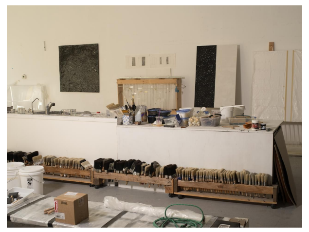
A scene from Corse's studio. From left, "Black Earth," fired earth clay, 48 x 48 inches, circa 1975 and works in progress.

As the works at the Whitney demonstrate, Corse has been on a remarkably consistent artistic trajectory for decades. "Capturing light has been her quest," notes Conaty. The earliest painting in the show, 1964's Untitled (Octagonal Blue) , is one of the rare instances of color; many of the other pieces are predominantly white. "Different colors make for different internal journeys," says Corse. "They create emotions and feelings." But the clue is in the materials: The metal flakes embedded in the acrylic blue paint show her trying to render light. That quest continued with her fluorescent light boxes, like Untitled (White Light Series) from 1966.