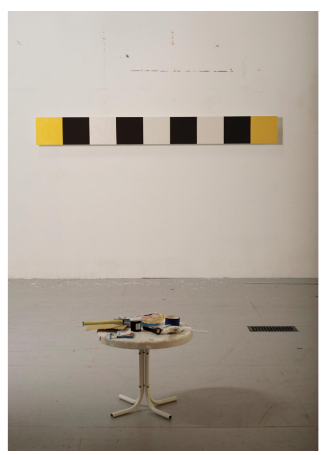
TOOLS OF THE TRADE Corse's painting Untitled (Yellow, Black, White, Beveled), 2010. PHOTO: MARY CORSE, UNTITLED (YELLOW, BLACK, WHITE, BEVELED), 2010, GLASS MICROSPHERES IN ACRYLIC ON CANVAS, 12 X 108 INCHES

Flavin, Donald Judd, Walter De Maria and Louise Bourgeois, among other greats, while Lisson will present eight new pieces. The Whitney survey, which opens on June 8, will consist of more than two dozen works from the past 54 years. The luminous abstract canvases that will be seen there—each packs a maximal wallop with minimal means—will be a discovery for many visitors.